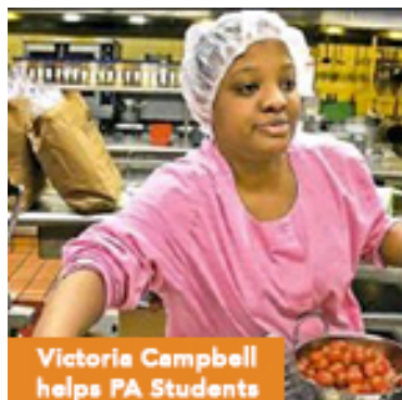
WIOA: Collaboration for Student Success