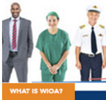
What is WIOA?

Learn how states, schools and agencies are addressing WIOA's Pre-Employment Transition Services