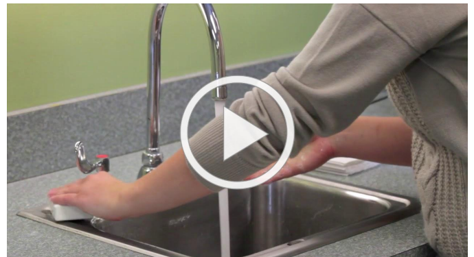
Proper Handwashing Demo in our Curriculum

In addition to 'Social Distancing' and other best practices, the CDC continues to stress that frequent, proper handwashing is one of the most important strategies everyone can employ to control the spread of disease. Here are the Five Steps to Wash Your Hands the Right Way , as outlined on their website: