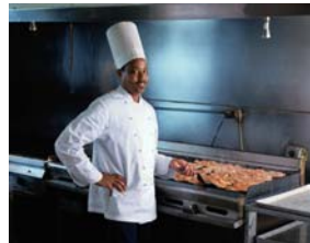
B. Food Service Worker