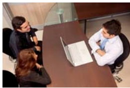
A. Social Worker

1. Which is a career in travel, tourism, and hospitality?