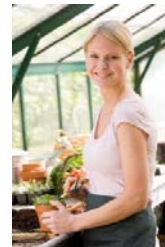
C. Greenhouse Worker