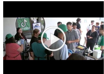
WorkAbility and Transition to Adulthood